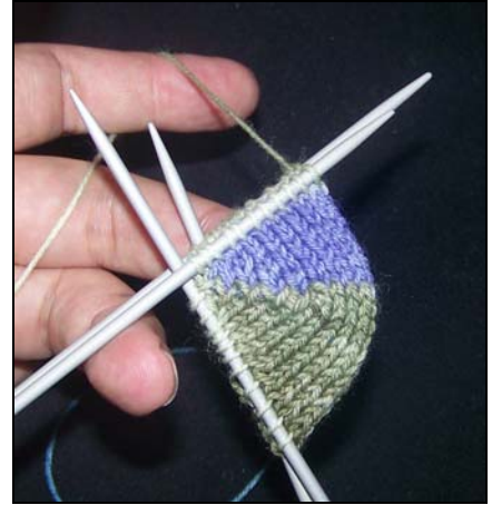
This is what your completed toe will look like. Notice the bottom is a different color than the top,

You should again have 18 sts on the DP needle and 18 still on the circular needle. Your completed toe will look like a neat little cup. Also this needle will be known as needle #1. Now you are ready to set up for the foot. (begin working in the round by picking up and working the stitches that are on the circular needle.)