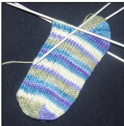
The heel is worked in the same manner as the toe.

*If you prefer to use 3 needles, or two circulars, then you can but if you are not familiar with sock knitting or my techniques, I recommend using the 4 DPs for your first pair.